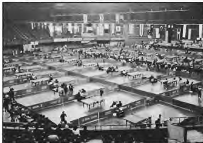
A general view of the tournament.

England womens team sailed through the first stage, but soon came unstuck losing all three matches in the second stage, the less said the better on those matches. One exception - England women finished on a brighter note with a late 3-2 victory over Sweden with Lisa Bellinger winning the decider against Svenson 12-21, 22-20, 21-7.